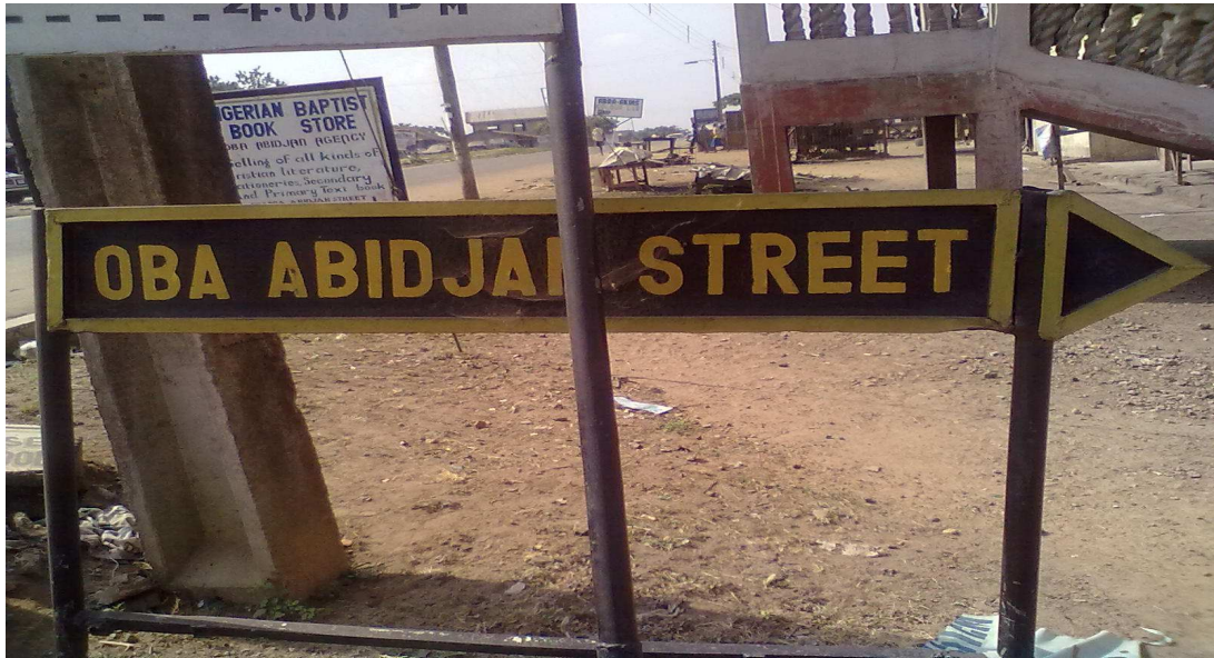
Fig. III: One of the major Streets in Ejigbo, Nigeria