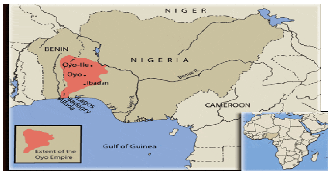
Fig. II: Map of Nigeria showing the limits of Old Oyo Empire

Source: http://brown.edu/Faculties/Haffenreffer/yoruba2.html , 06/08/2011