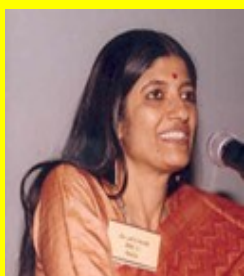
Professor Jayati Ghosh

Educated at Delhi University, Jawaharlal Nehru University (JNU) and the University of Cambridge, Jayati Ghosh is a distinguished and extraordinarily prolific economist and professor whose many interests include globalization, international finance, employment patterns in developing countries, macroeconomic policy, and issues related to gender and development.